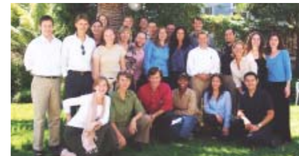
TransFair USA staff, interns, and volunteers.

♻️ Printed on 50% recycled and 15% post consumer waste paper.